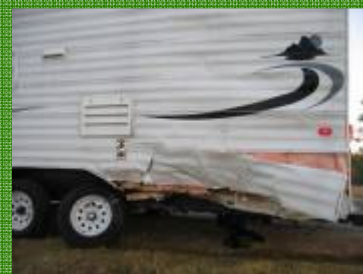
Trailer & Car Wreck